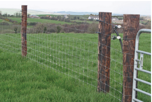
Table 1: Fencing options